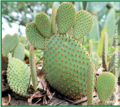
Blind cactus ( Opuntia rufida ) Oval/round pads to 15 cm long and 12 cm wide. Clustered red-brown barbed bristles. Flowers yellow to red. Fruit red-purple.

Prickly pears are fleshy-stemmed cacti that belong to the Austrocylindropuntia , Cylindropuntia and Opuntia groups of plants. There are over 27 different species in Australia. The prickly pears below are the most common ones that are illegally traded.