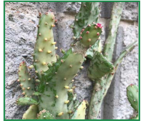
Opuntia monacantha f. monstrosa variegata These are distorted forms of drooping/smooth tree pear with white, cream, yellow, light green and pink discolourations.