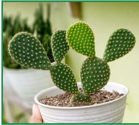
Bunny ears ( Opuntia microdasys ) Oval/round pads in pairs up to 15 cm long and 12 cm wide. Clustered yellow or white barbed bristles. Flowers yellow. Fruit red-purple.