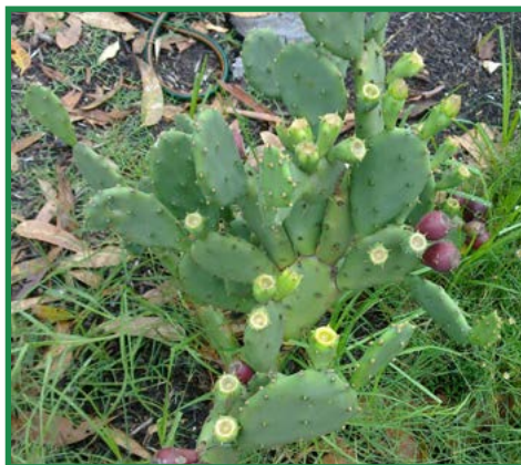
Common pear ( Opuntia stricta ) Oval pads to 35 cm long and 20 cm wide. Spineless or with groups of 1-2 spines, 2-4 cm long.