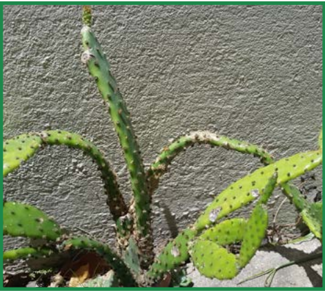
Chicken dance cactus ( Opuntia schickendantzii ) Dull-green pads to 35 cm long and 5 cm wide, like flattened tubes. Spines up to 1 cm long. Yellow to orange-yellow flowers. Green fruit.