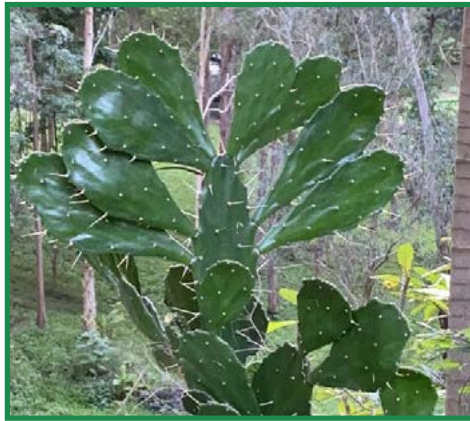
Drooping/smooth tree pear ( Opuntia monacantha ) Thin, shiny, drooping pear-shaped pads to 50 cm long and 18 cm wide. Spines in groups of 1-3. Yellow flowers. Red fruit.