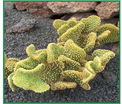
Monstrosa form of bunny ears ( Opuntia microdasys f. montrose ) Also called crazy bunny ears. Pads are fused together and curved rather than flat.