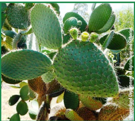
Aaron's beard cactus ( Opuntia leucotricha ) Oval/round pads to 30 cm long and 20 cm wide. Clusters of white spines up to 4 cm long. Yellow flowers and fruit.